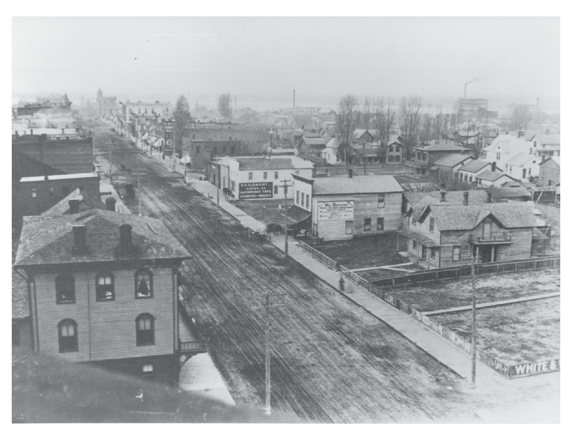
Holland's East 8th Street business district before the construction of the Knickerbocker