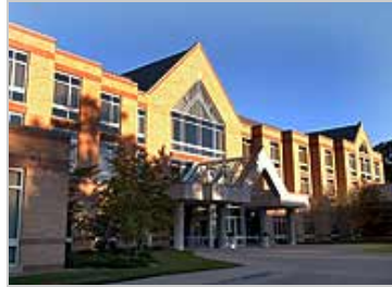
Haworth Inn and Conference Center