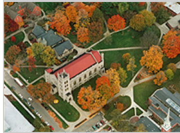
Aerial View of Dimnent Chapel and Graves Hall