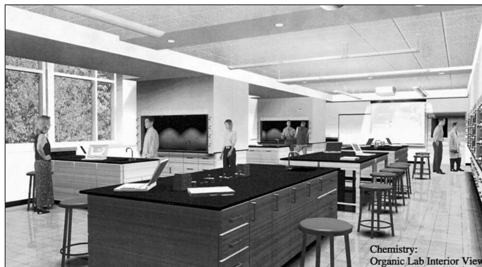
An architect's rendering of a chemistry lab in the new science building. Such spaces are being designed with not only current needs but also future directions in mind, and should serve well in helping preserve Hope's strong tradition of active, research-based learning in the sciences.