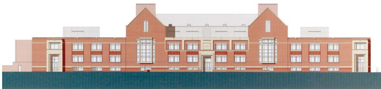
A conceptual view of the new science center, looking north. The current Peale Science Center forms the right side of the building. The science center renovation and expansion comprises $36 million of the $85 campaign.

Goals for additional endowment include scholarships; faculty research funds and chairs; support for the academic program, internships and the student development