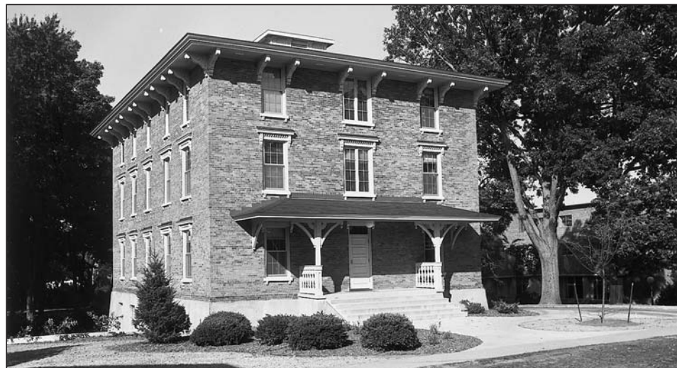
The very campus itself has grown through donors' generosity during fund-raising campaigns. Only some of the resulting familiar landmarks are shown here, but all are enduring monuments to those who gave their resources to help future generations learn at Hope. And the buildings are only the most visible manifestation of such support. At center is Van Vleck Hall; clockwise from top left are Graves Hall, Van Zoeren and VanderWerf Halls, the DeWitt Center, Cook Hall, the Van Wylen Library and the Dow Center.