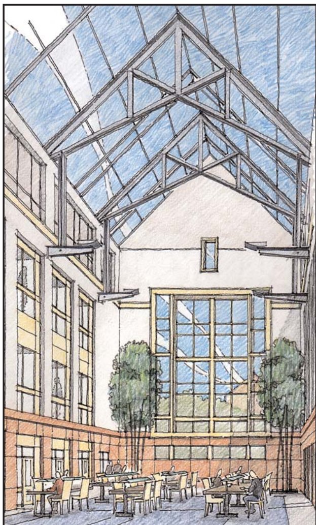
A spacious multi-story atrium will offer tables for studying or gathering.

with an "Award for Integration of Research and Education." Hope held more NSF "Research Experiences for Undergraduates" grants (five) this summer than any other liberal arts college in the country. A report from the NSF placed Hope in the top 25 nationally among baccalaureate colleges as a source of future Ph.D. recipients in the natural, physical and social sciences, and engineering—including third nationally in chemistry.