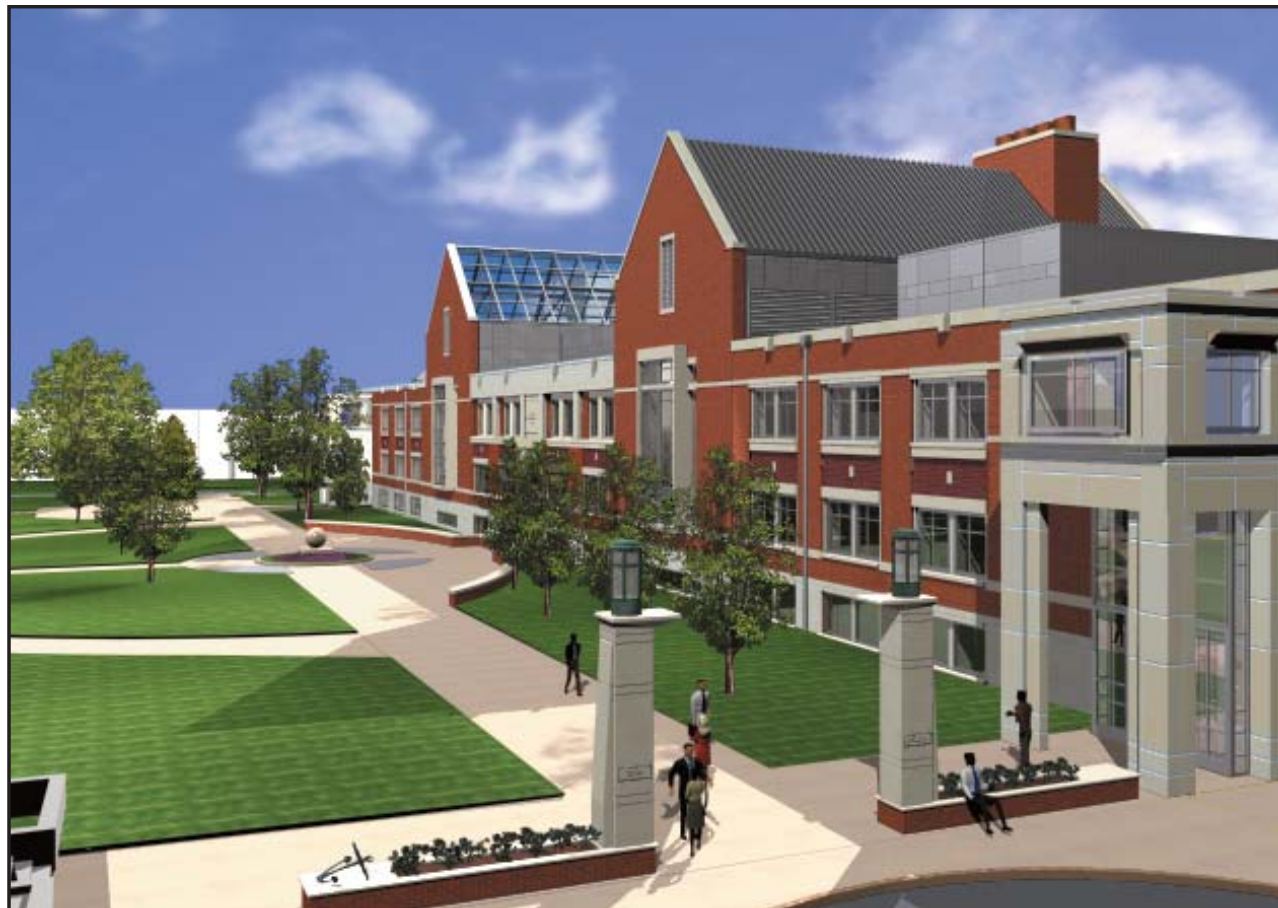
The renovated and expanded science center will update a facility that has served well but is in need of a major update. This view looks southeast across Van An-del Plaza from Graves Place (11th Street) near Central Avenue Christian Reformed Church.

By any number of measures, Hope is at or near the top nationally in science among the country's 1,100-1,200 liberal arts institutions. In 1998, for example, Hope was one of only 10 liberal arts institutions nationwide to be recognized for innovation and excellence in science instruction by the National Science Foundation (NSF)