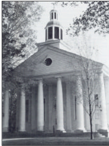
Pillar Christian Reformed Church, Holland Michigan This view of the church was used as the cover illustration for Family Quarrels .