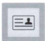
My ID Card