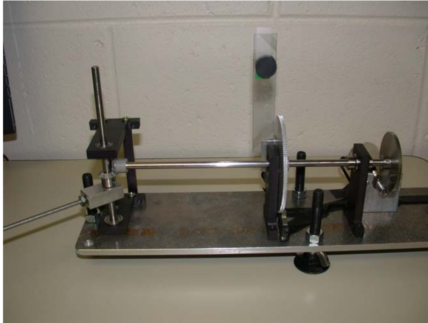
Figure 1: The Page Flipper